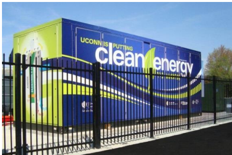
460 kW fuel cell combined heat and power system fueled by natural gas